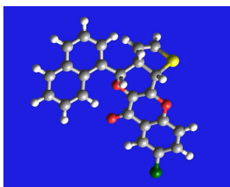
Figure 1. Energy minimized structure of 5b .

The stereochemical features of dihydro products 5a-5c and 6b,6c were analyzed by correlation between dihedral angle ( \phi ) and coupling constant ( J ). 6 The vicinal coupling constant ( J_{\text{vic}} ) between H-3a and H-11b was found to be 8.1 Hz in 5b and 6b that reflects the cis fusion of ring C and D, which is in concurrence with the reported data. 7 The hydrogen atoms at C-4 and C-3a are also cis to each other ( J_{3a,4}=10.0 Hz, \phi\sim 0^\circ ) in 5b and 6b , placing \text{-COOEt} and naphthalene moieties in pseudo-equatorial conformation on pyran ring C. Such a view is in conformity with the literature that a heavier group always prefers equatorial an disposition 6 in cyclohexane. All the three hydrogens (H-11b, 3a & 4) are above the plane of molecule with dihydrothiophene ring being 'exo' to the pyran ring C that is in the pseudo-chair conformation. The energy-minimized structure 8 of compound 5b is shown in Figure 1.