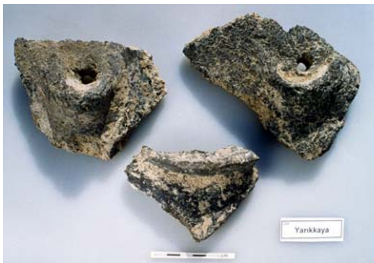
Figure 1. Chalcolithic potsherds from Yarikkaya, Turkey, showing the characteristic perforations and spouts.

It has been assumed – relying predominantly on indirect evidence – that the subsistence of the population living there in chalcolithic times was mainly based on secondary animal products, in particular on milk and on more durable products thereof which might also have been valuable as provisions for the cold time of the year. 3