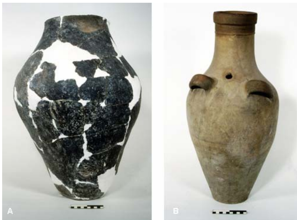
Figure 3. (A) Restored spouted jar from the chalcolithic settlement at Yarikkaya, Turkey. (B) Modern yayık (pottery churn) from Central Anatolia.

At any rate, for both hypotheses a chemical identification of still remaining traces of animal fat in such prehistoric potsherds would be valuable, enhancing the probability that this special type of jar was really used for the production of a dairy produce, thus also shedding some more light on the economic basis of chalcolithic life in the mountainous areas of Central Anatolia.